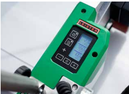
Regulated welding parameters

The compact UNIROOF 300 automatic welding machine is ideally suited for welding medium to large, flat roofs and is ideal as an entry-level machine due to its simple operation.