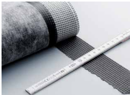
Standard nozzle for optimum weld seam width