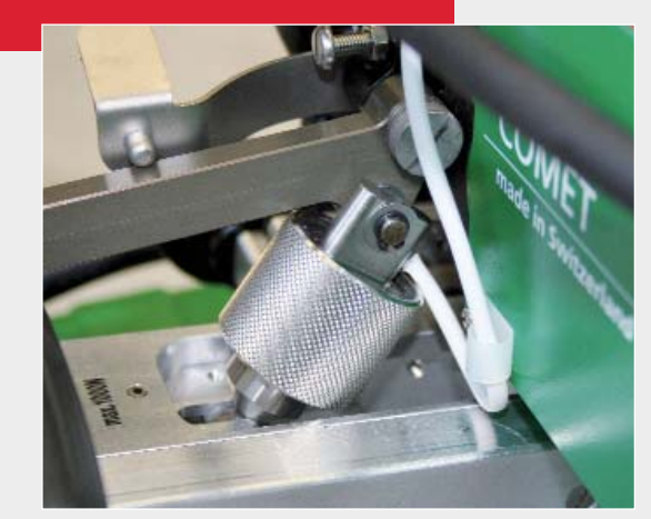
Pressure measurement with COMET USB.