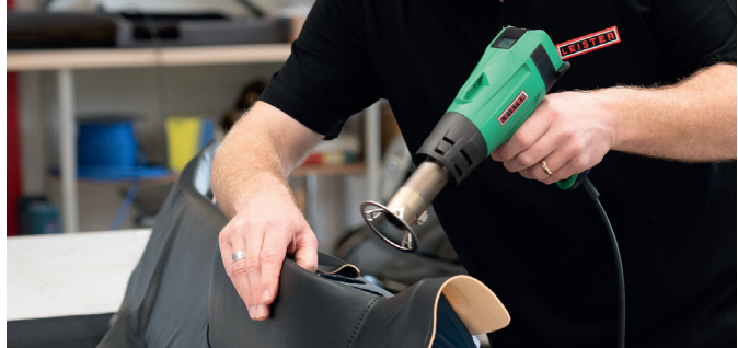
SOLANO AT - Difficult leather parts - safe and efficient processing